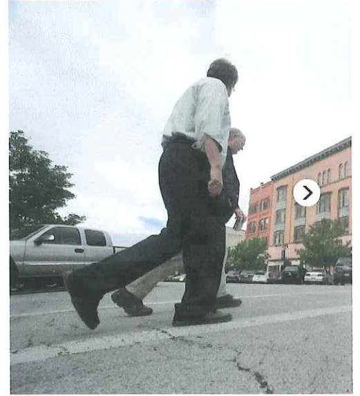
Provided artist rendering/VINTAGE DEVELOPMENT GROUP

2 / 16 An artist rendering reimagines what the new Sandusky City Hall could look like. An $18.5 million publicly financed plan calls for renovating the Calvary Temple church and Kingsbury buildings on Columbus Avenue and Washington Row near Small City Taphouse into a new administrative complex for city officials.